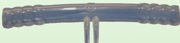
SSP - Soft Silicon Prongs that prevent skin irritation